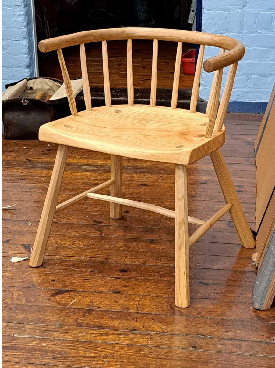
Ted Higgs – July 2024